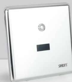
Stainless steel cover with electronics

Janitor Flush every 24 hours maintains hygiene when bathroom is out of use.