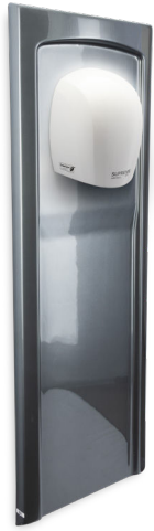
Supreme Maxi Shield