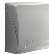
Supreme Master Air