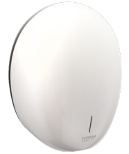
Supreme dri bubble