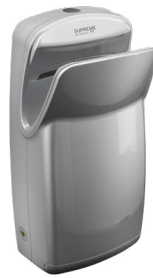
Supreme Jet Dry Exec II