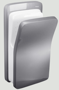
Pearl Grey SFF-PHPG