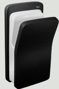
Matte Black SFF-PHBM