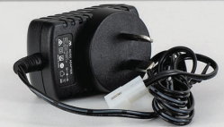
Master Flush - Mains Power AWS300A