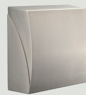
Stainless Steel BA408