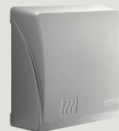
Natural Steel BA405