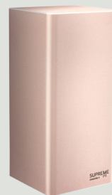
Rose Gold DD50V-RG