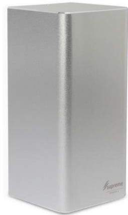
Silver - DD60V-S