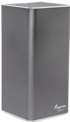
Titanium - DD40V-T