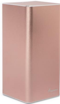
Rose Gold - DD50V-RG