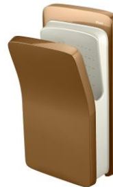
Pearl Gold SFF-PHGOLD