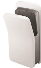
Ice White SFF-PHW