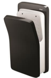
Matte Black SFF-PHBM