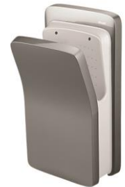
Pearl Grey SFF-PHPG